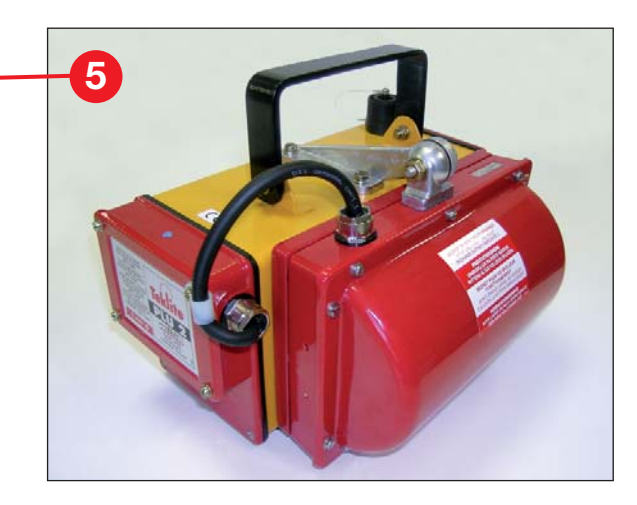
Lamp in closed position gives protection against accidental damage.