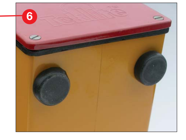
Strong rubber caps for good stability.