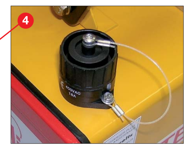
Binder socket to plug in the Teklite charger to charge the 12 volt 12 Ah battery. Finish: Yellow RAL 1007 Red RAL 3000