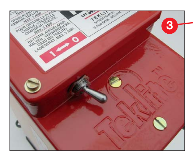
Built-in circuit board with integrated ON/OFF