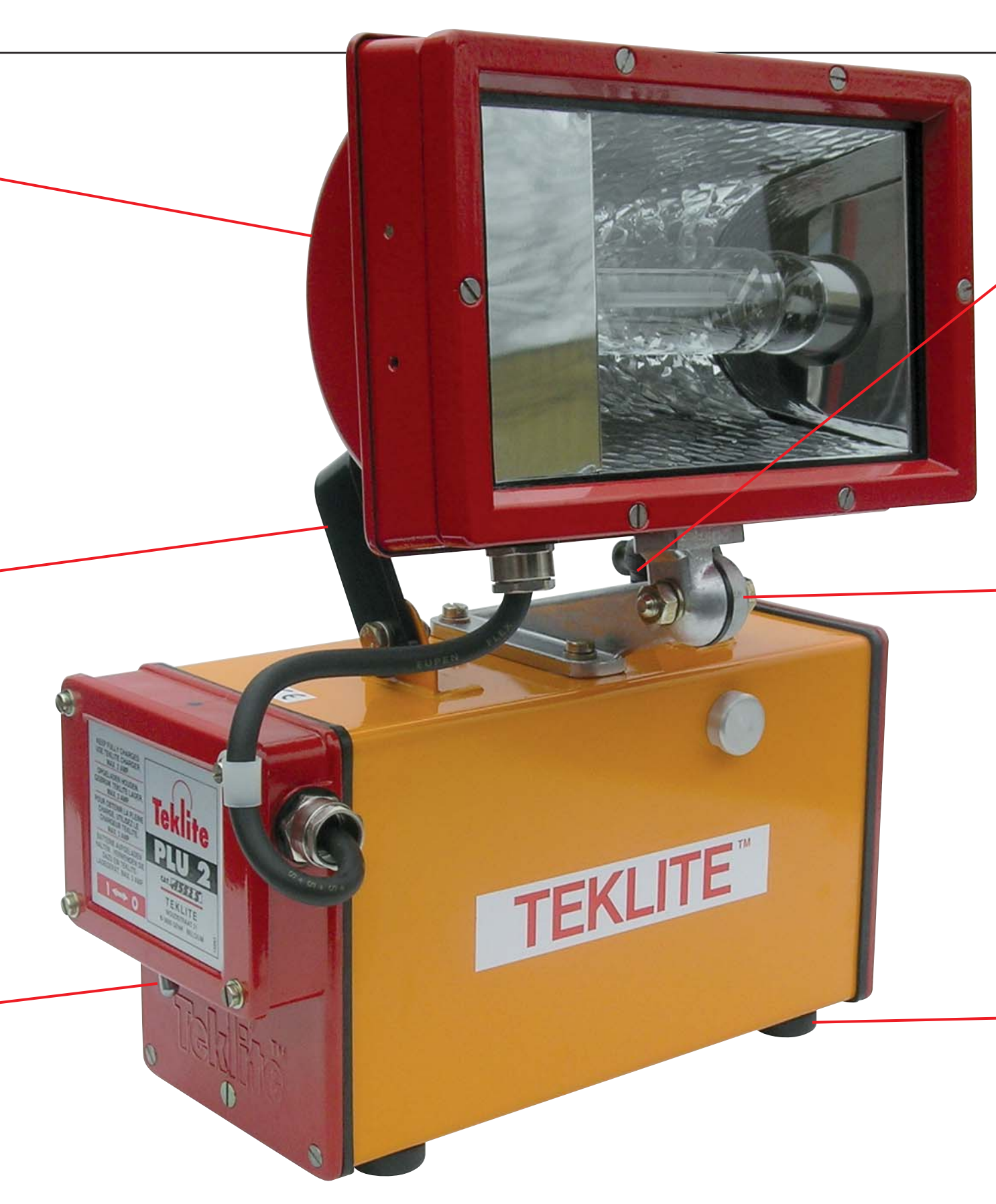
PLU 2 models