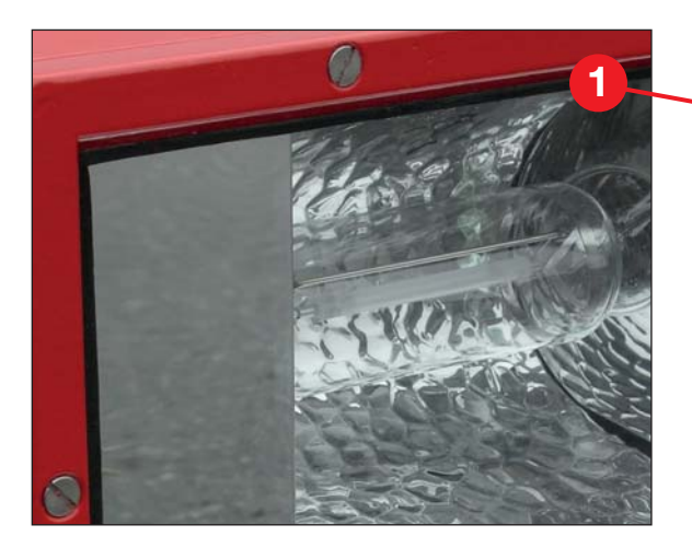
70 Watt, 12 Volt HPS (High Pressure Sodium) or MH (Metal Halide) bulb. Lamp protection: IP65