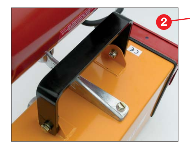
Rigid carrying handle.